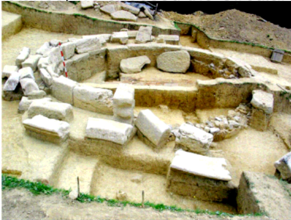
The Circular Funeral Monument

For instance, we chose the Circular Funeral Monument.