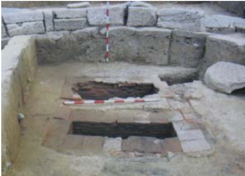
Graves M1 and M2

Outside the monument were discovered other two cremation graves M1 and M4.